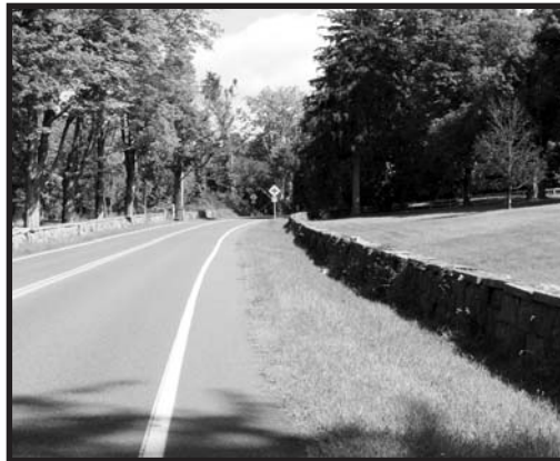
Stone walls along River Road

THE BEAUTY OF OUR ROADS, ITS TREES, STONE WALLS AND VIEWSCAPES IS IMPORTANT IF WE ARE TO KEEP OUR TITLE "RHINEBECK, THE PARLOR OF DUTCHESS COUNTY."