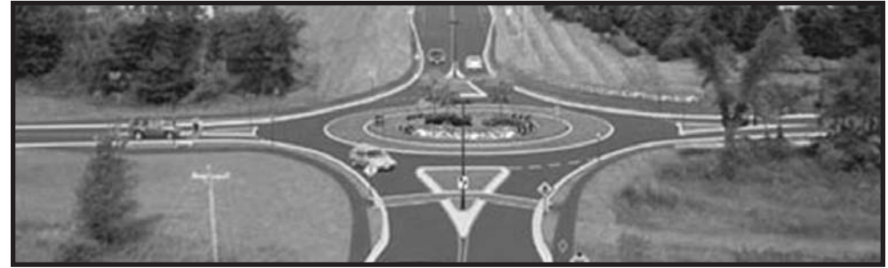
A LANDSCAPED ROUND-ABOUT WITH NO TRAFFIC LIGHT ALLOWING FOR SAFE MOVING TRAFFIC.