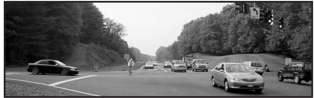
ADDITIONAL LANES WERE ADDED TO THE RECENT SUBURBAN-LIKE HIGHWAY CONSTRUCTION AT THE BRIDGE APPROACH ON RIVER RD. AND RT. 199.

Rhinebeck Republican Committee PO Box 744 Rhinebeck, NY 12572