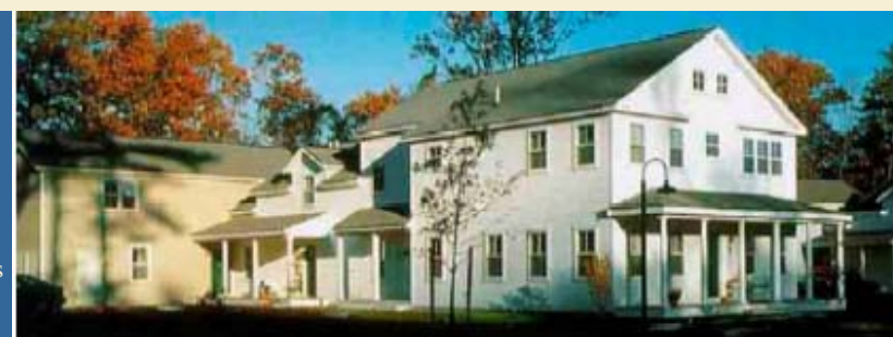
Four attached residential units