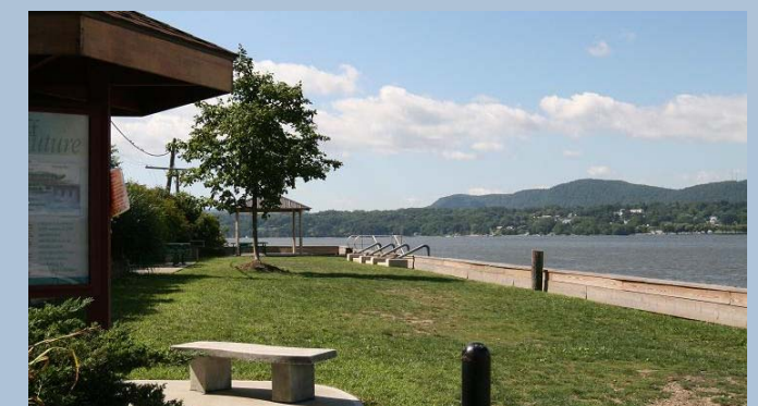
Park at Rhinecliff Landing