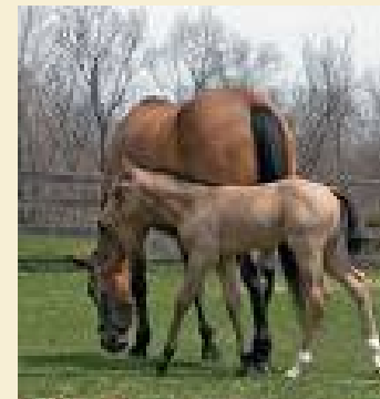
. . . Farms and Agriculture