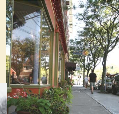
. . . Historic Village Center