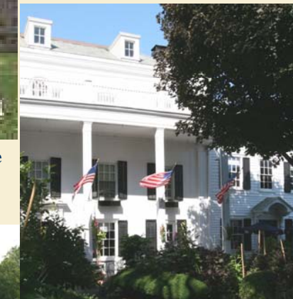
. . . Architectural History