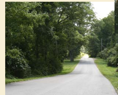
. . . Scenic Roads

Community Service Is Our Cornerstone ... RHINEBECK MATTERS!