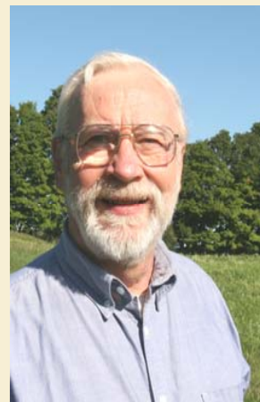
Dutchess County Legislator Raymon Oberly

Now more than ever we need your support!