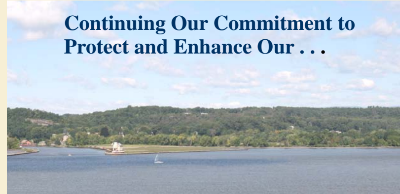
. . . Hudson River, an American Heritage River

Continuing Our Commitment to Protect and Enhance Our . . .